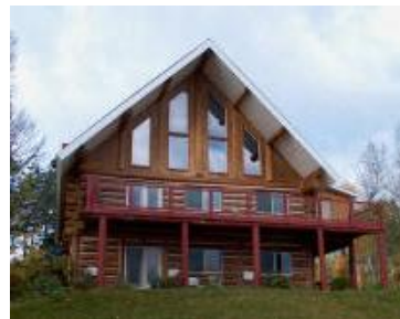
THE MAIN LODGE

Choose to do it all, or nothing at all! Foremost is our world-class sport fishing. Catch trophy Walleye, tackle-busting Lake Trout or Northern Pike. Or enjoy water-skiing, tubing, and canoeing.