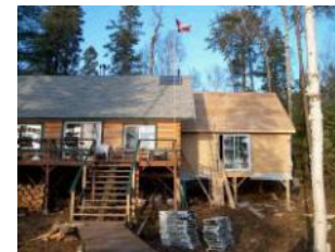
DEAD BEAR BAY CABIN