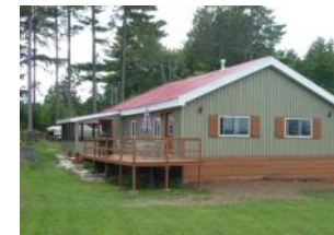
THE OLD LODGE